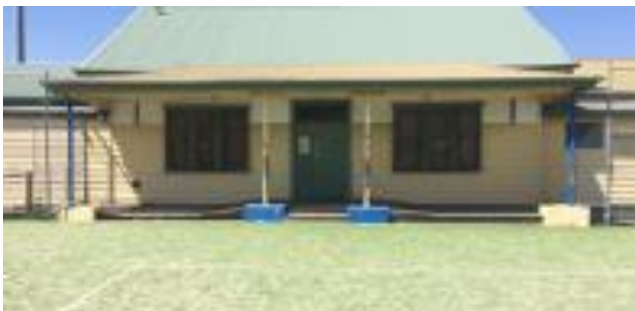
Above: Before photo of Fearon Reserve Lacrosse Pavilion (15 September, 2019)

The upgrade works to Fearon Reserve Lacrosse Pavilion included the construction of a new umpire’s change room and compliant DDA change room, replacement of the veranda, weatherboards, social room floor boards, and painting throughout. The works also comprised the installation of floor insulation and “smart glass” windows, and the painting of the roof with a “cool roof” product to improve the energy efficiency of the pavilion. The works also included the replacement of chain wire mesh fence around the Box Lacrosse court and reinforcement of existing posts. The project was completed in February 2020.