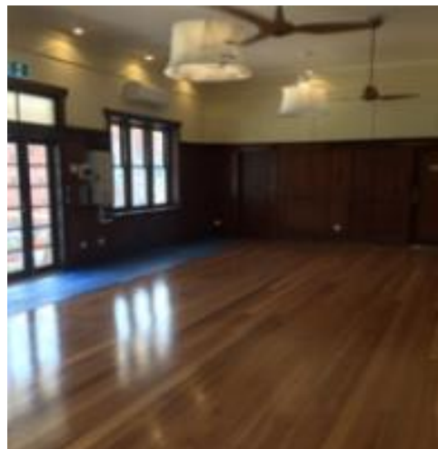
Above: New social room sub floor, floorboards, lighting.