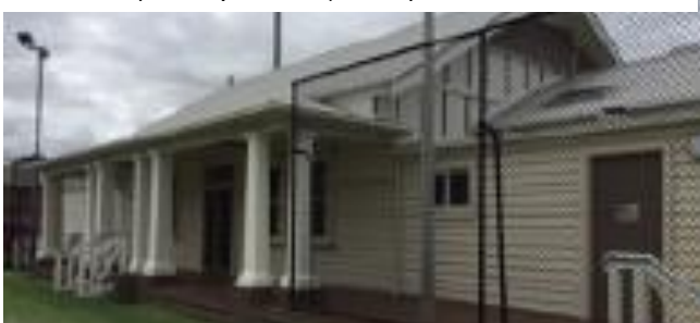
Above: Fearon Lacrosse Pavilion once completed (28 February 2020)